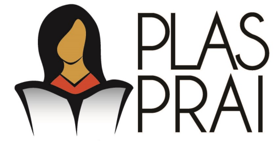
transforming lives . . . transforming communities

For more information or to give a one time gift, visit our Preah Vihear team website at: worldteampreahvihearcambodia.org