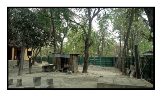
The new dorm building will be built directly to the right of the house parent house. And the current "fowl" residents will have to find a new home!